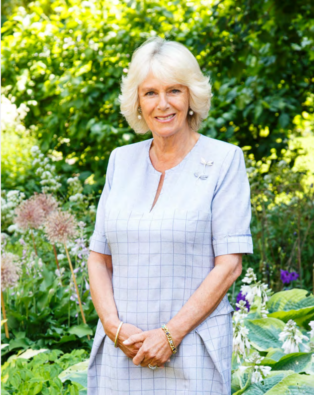
Her Royal Highness The Duchess of Cornwall