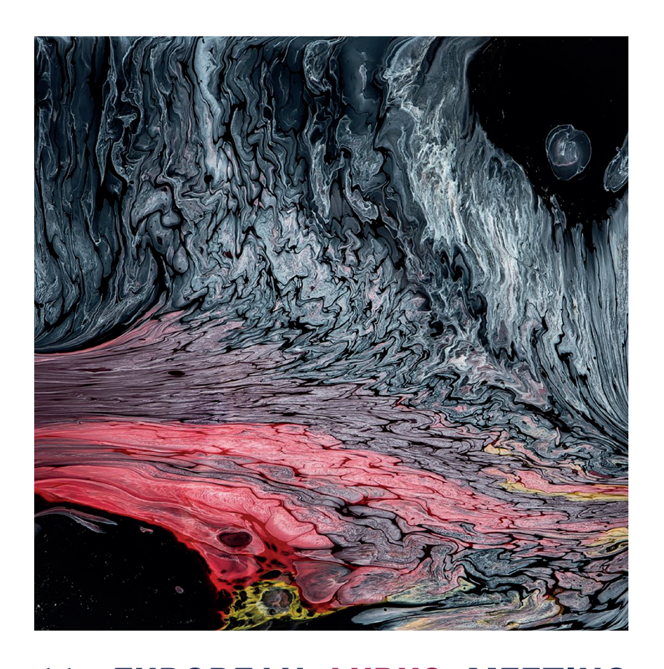
11. EUROPEAN LUPUS MEETING DÜSSELDORF 21.-24. MARCH 2018